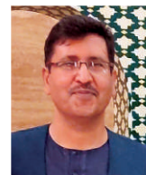
Dr. Abul Hassan Govt. Millat Graduate College Mumtazabad Multan