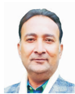
Dr. Sharafat Ali Graduate College Kot Sultan Punjab